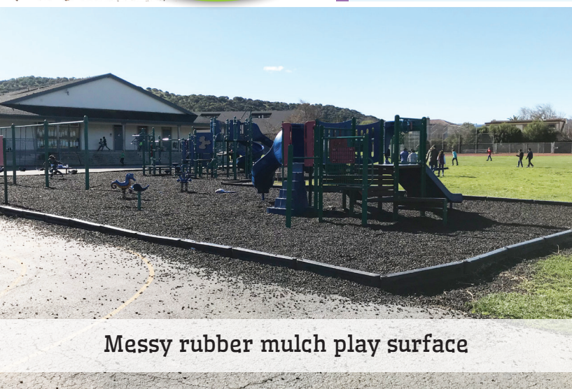
Messy rubber mulch play surface