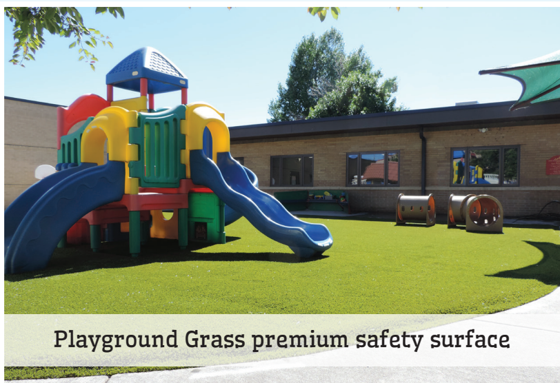
Playground Grass premium safety surface

This is what kids were meant to play on!